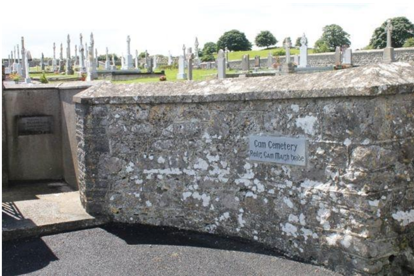
Cam Cemetery, Cam, County Roscommon

Cam Cemetery contains only 1 Commonwealth War Grave.